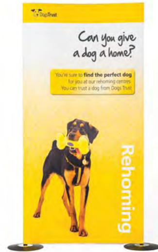
Replacement Graphics from £68 2m High quality graphic display panels Hook over graphic panel attachment system