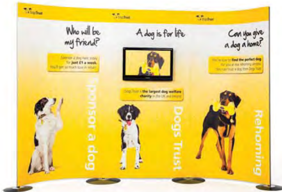
Monitor Stand from £65 Monitor Bracket conforms to VSA 50, 75 & 100mm hole Pattern