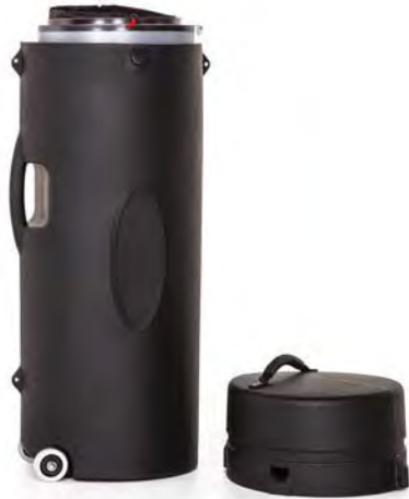
Wheeled Graphics Drum from £59 Portable storage case to store Streamline graphic panels.