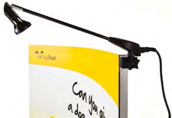
Panel Spotlight from £19.80 Display Panel Spot light, 50 watt mains spot light, 3 metre lead & plug, panel fitting