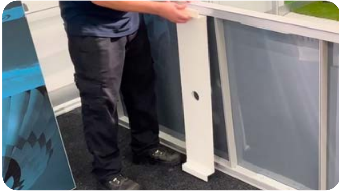
Exhibit Exhibition Arch - Attaching Lights