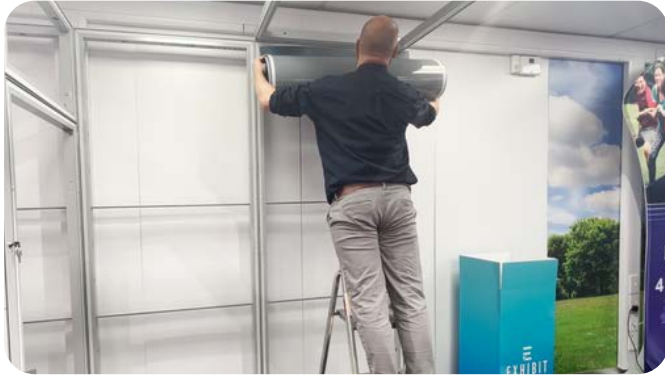
Exhibit Exhibition Arch - Attaching Panels