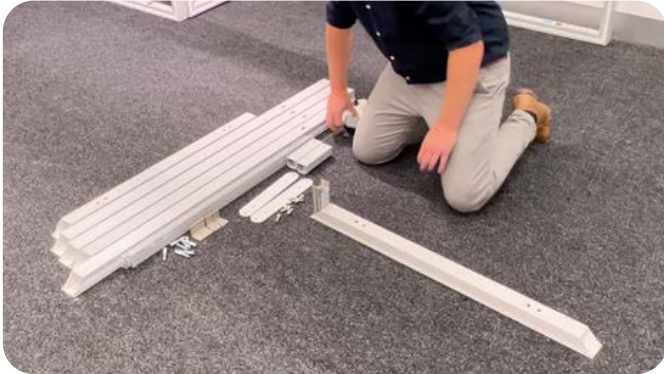
Exhibit Arch - Assembling the Overhead Panel